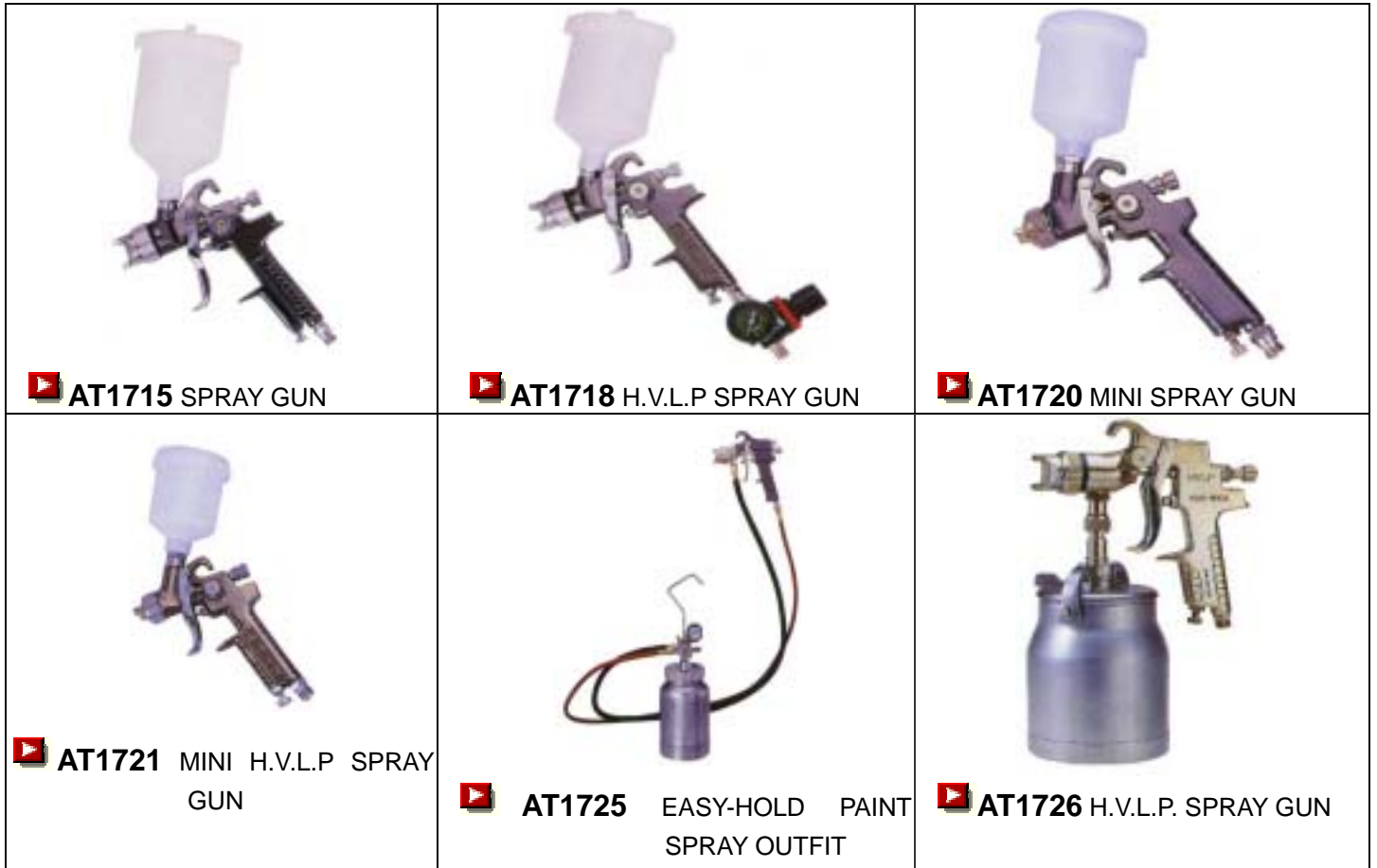
AT1715 SPRAY GUN